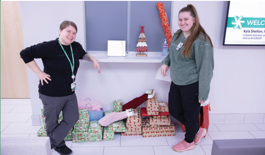
Conway Regional Employee Christmas Gifts for families who need extra support