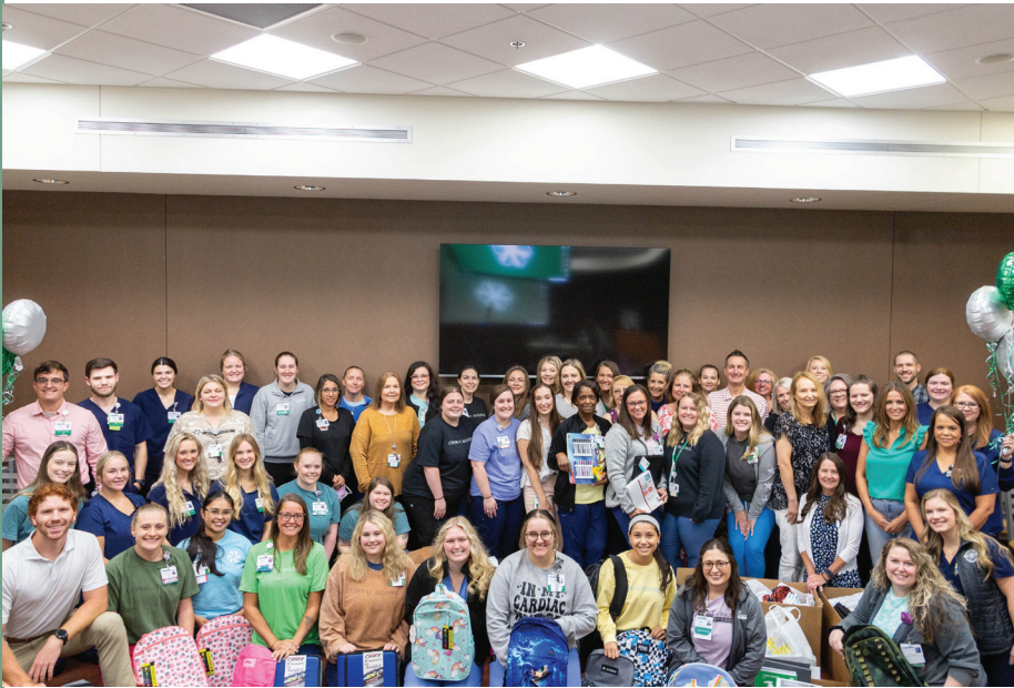
United Way Stuff the Bus for School Supplies