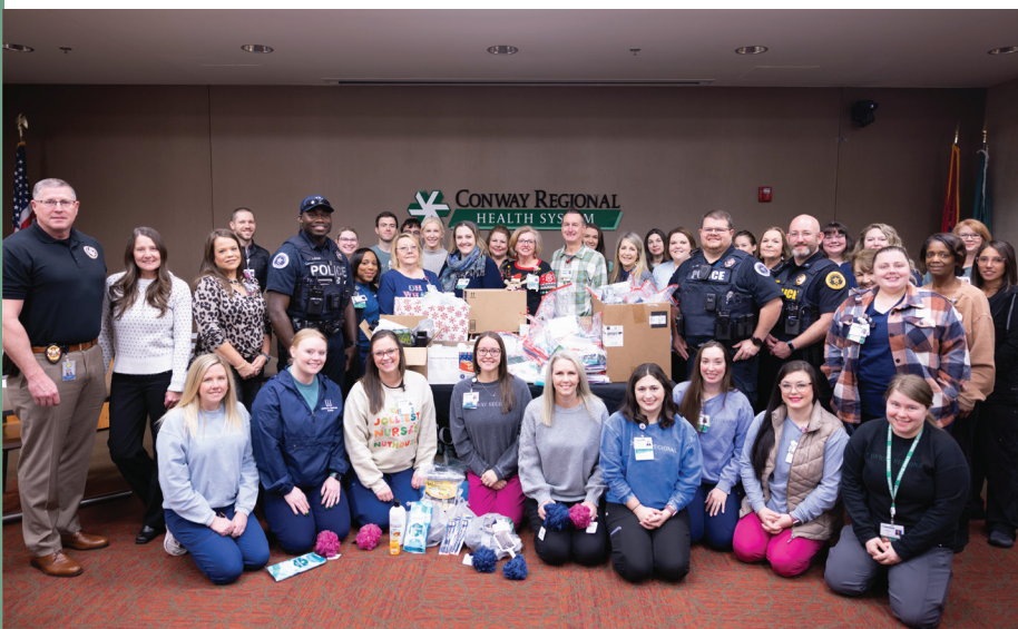
Conway Police Department Santa's Helpers Hygiene Supplies Collection